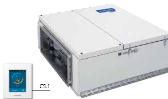
The photo is intended for informational purposes only. exact details may vary.